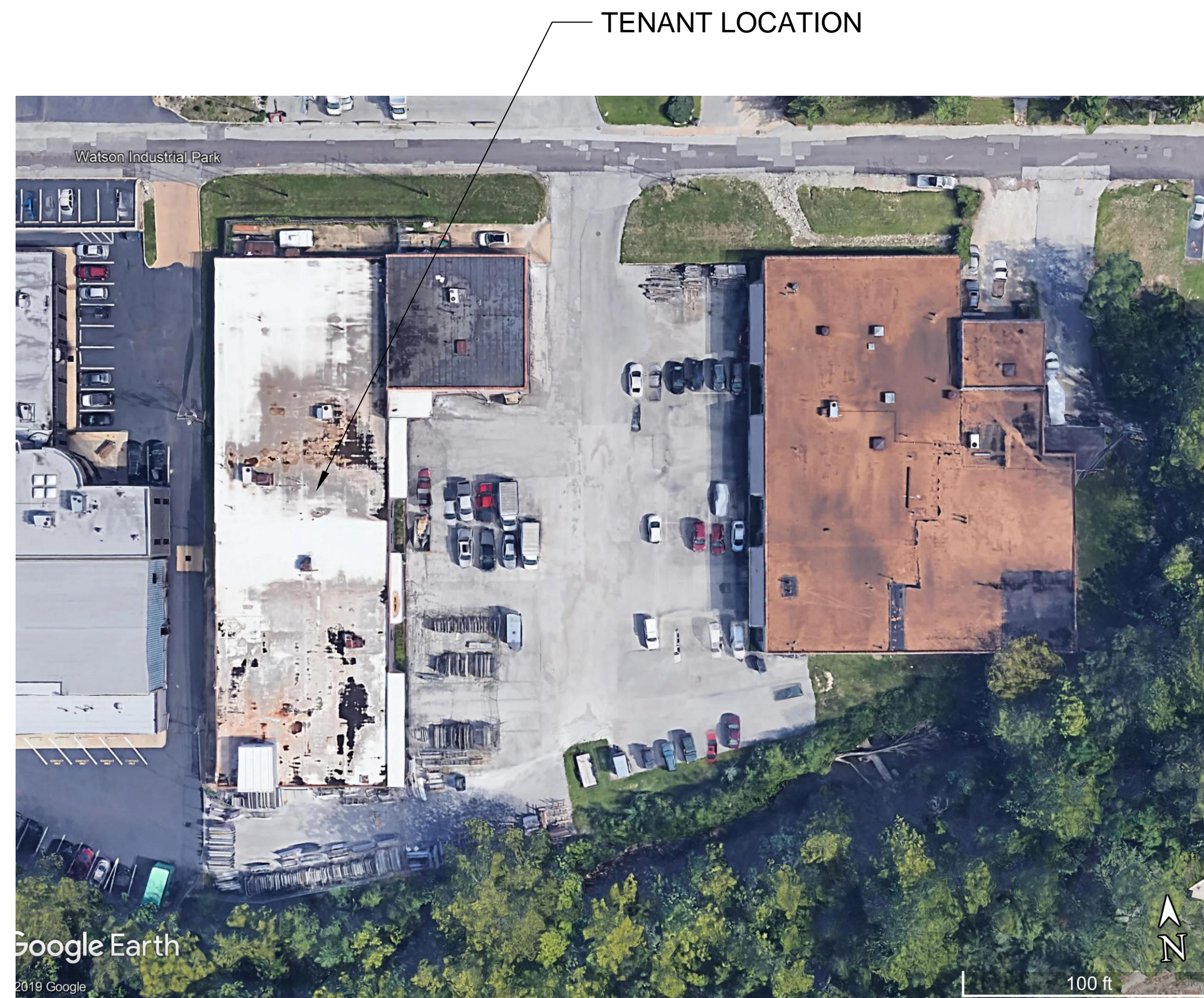
Location Plan Not to Scale

Building data: Tenant Name: Stone Strength Systems Address: 9462 Watson Industrial Park Construction Classification of Shell Building: IIIB (observed) Use Group: B- Business Occupant Load of Tenant: Training Area 1810/50 s.f. = 36.2 Office 650/100 s.f.. = 6.5 Total = 42.7 Building is Not Sprinkled